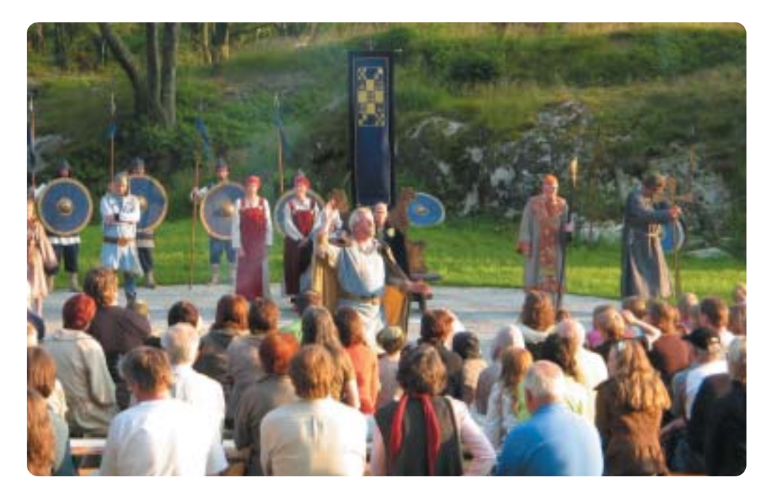
From the Håkonar theatrical performance in 2006.

This is a noble target which aims to create positive effects from investments for the years to come. The development plan for the Gulatinget Millennium Site for the project period 2006-2010 provides an overview of the strategies and development initiatives which will contribute towards achieving this target.